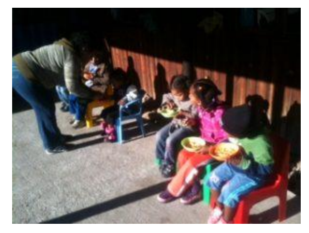
Lunchtime for the crèche kids